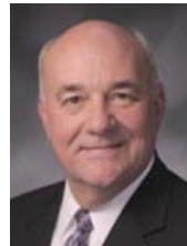
Rep. Jim Neely (MO)