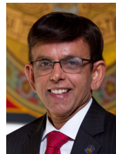
Rep. Prasad Srinivsan (CT)