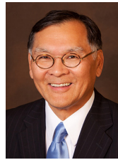
Sen. Brian Shiozawa (UT)

administer opioid antagonists on or near school premises.