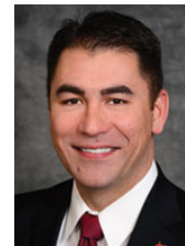
Sen. Tom Takubo (WV)