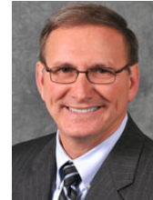
Sen. Ron Stollings (WV)