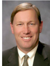
Rep. Stewart Barlow (UT)