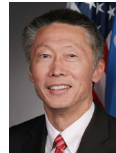
Sen. Ervin Yen (OK)